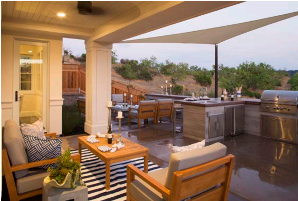
The backyard of one the first homes at Harvest Court in Moraga offers lovely views.